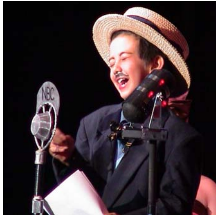
HCT students perform "Annie" at Convention Hall.